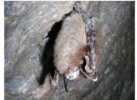
WNS infected bat in Eastern USA

Hibernating bats are most at risk to WNS disease. Bats that migrate (e.g. hoary bat) can travel hundreds and even thousands of kilometers, while hibernating bats do not tend to travel long distances between summer and winter roosts. There is a significant difference in bat diversity on the east and west side of the Rocky Mountains, suggesting this may be a partial barrier to bat movement. If bat-to-bat transfer remains the mode of spread for this fungus, and humans take precautions to not spread the fungus, the west could remain WNS free for many years. Preventing a giant leap of the P.d. fungus is the most important thing humans can do for western bats.