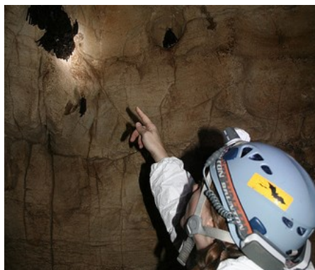
Bat ecologist counts bats

Preventing a giant leap of the P.d. fungus is the most important thing humans can do for western bats.